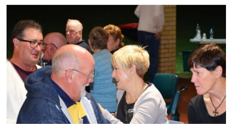
After Mass, speak with others