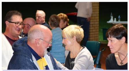
After Mass, speak with others