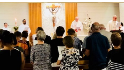
During Mass, let God speak with you