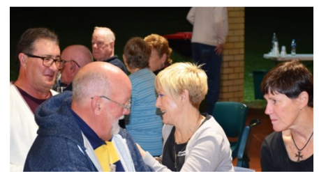
After Mass, speak with others