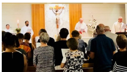
During Mass, let God speak with you