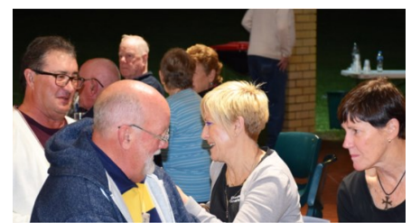
After Mass, speak with others