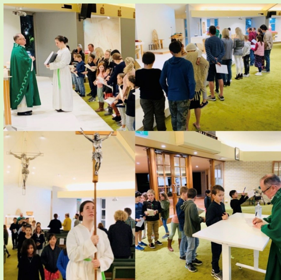
(Rite of Enrolment 2020 @ Mary Immaculate)

16th of August 2020 Week four The Gift of the spirit (page 24 to 29)